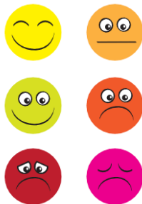
Cards to indicate positions